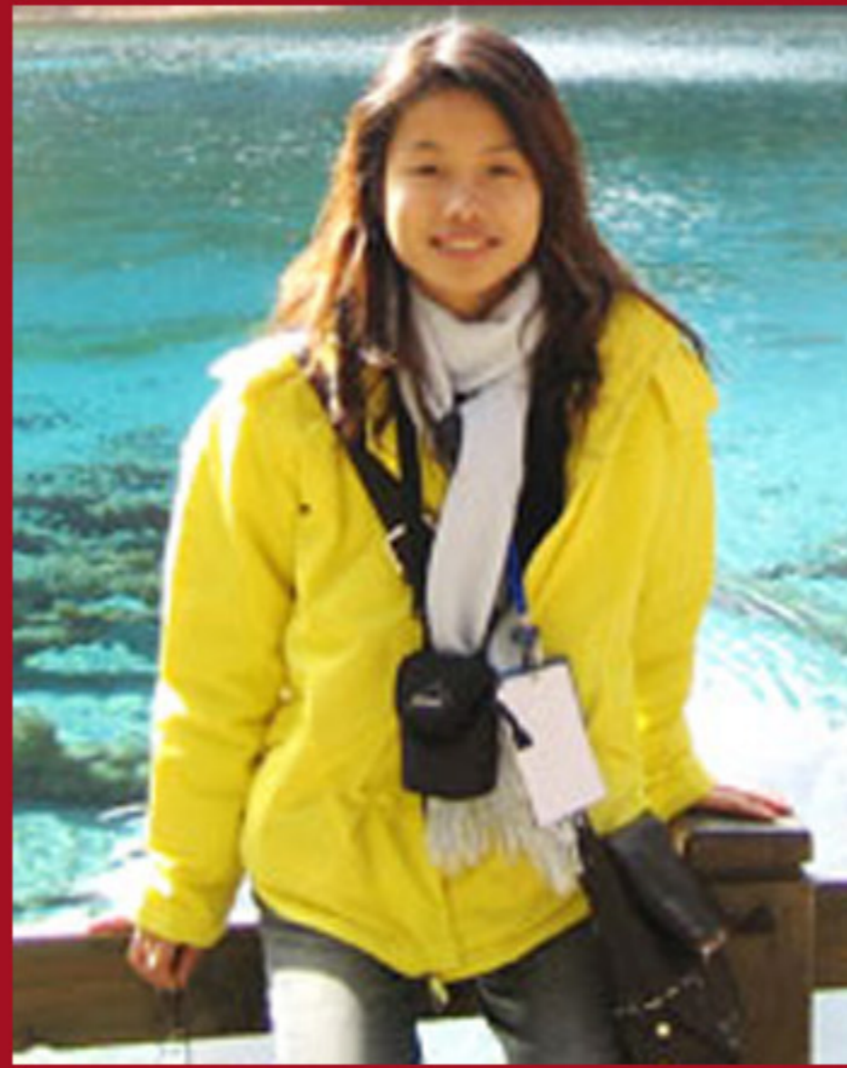
Echo-Your Guide in Xi'an