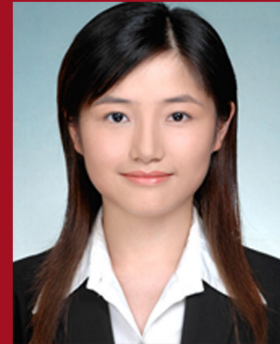
Rainy-Your Guide in Shanghai