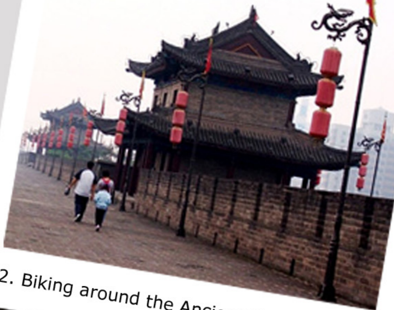
2. Biking around the Ancient City Wall