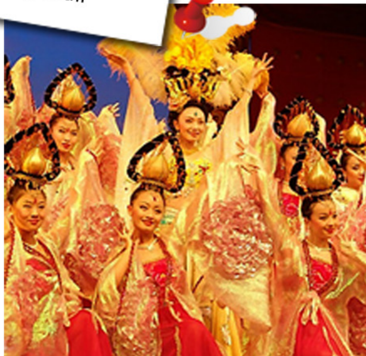
3. Tang dynasty show at Tang Yuegong