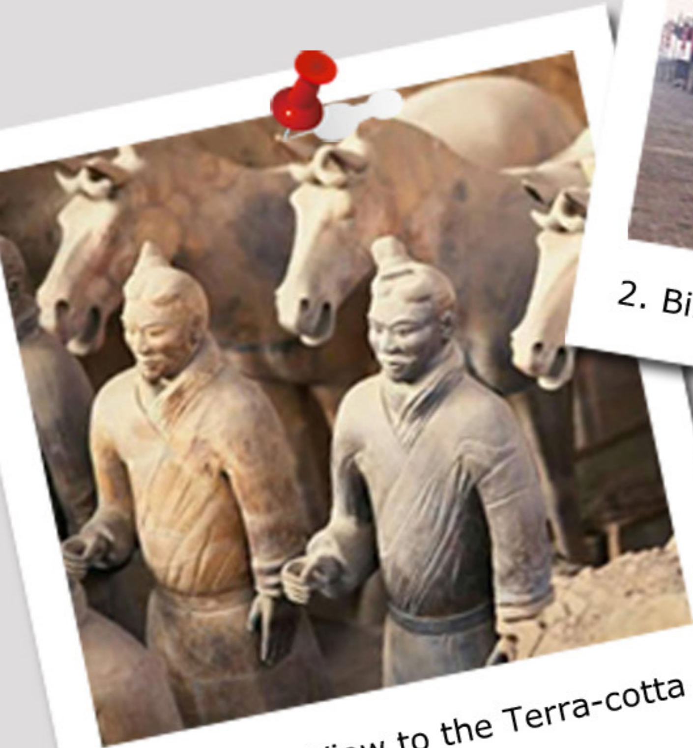
1. Close-up View to the Terra-cotta Warriors and Horses In this tour, China Highlights will get you the privilege for a close view in the pits which are not available to the ordinary tourists. More impressive than imagined!