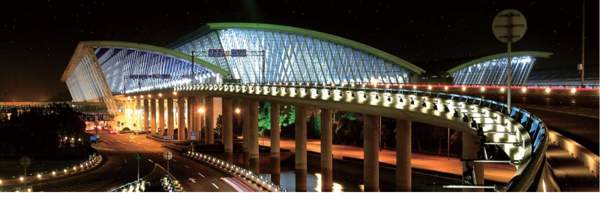
Shanghai Pudong International Airport